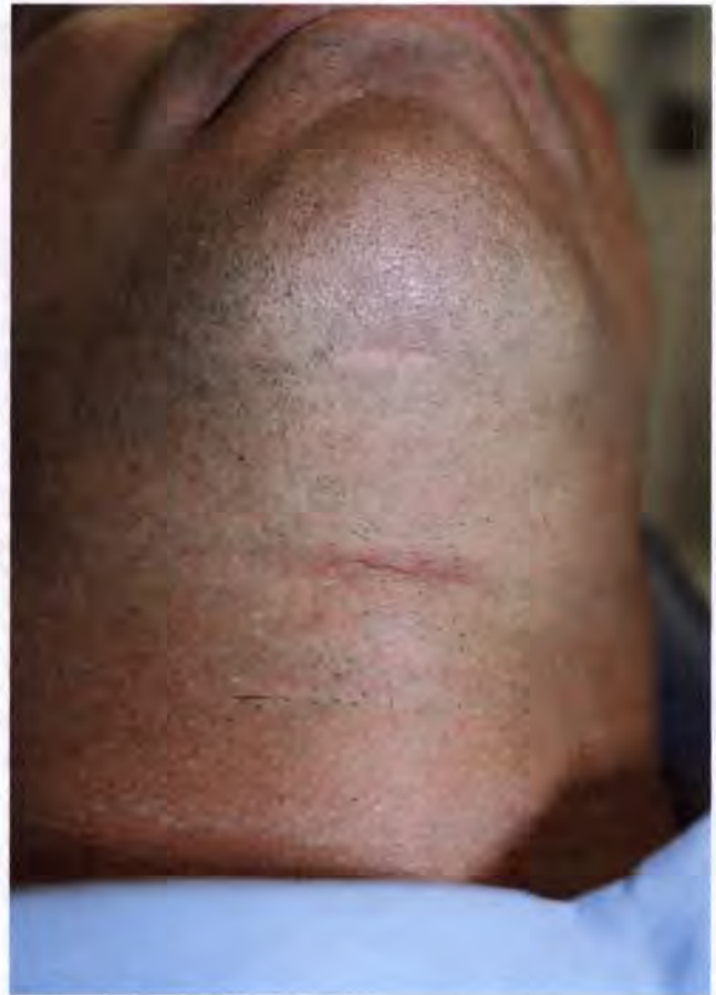
Figure 1. Postoperative appearance of neck incisions in a patient who received the minimally invasive hyoid myotomy and suspension technique.

A 2-cm incision is made in the mentum just posterior to the chin after injection of lidocaine 1% (or alternatively Marcaine 0.05%) with 1:100 000 epinephrine. A right angle clamp is used to dissect the underlying tissue to the posterior table of the mandible. A separate 2-cm incision is then made over the hyoid bone. The soft tissue overlying the hyoid is then