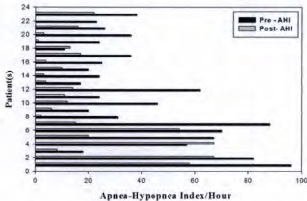
Figure 2. Individual preoperative and postoperative apnea-hypopnea index (AHI) outcomes.

1 underwent the postoperative sleep study with overall AHI falling from 62 to 14. This patient was a 45-year-old man with a BMI of 31.6 kg/m 2 . The majority of patients were surgical successes by classically defined criteria, and 10 patients achieved minimal levels of persistent apnea.